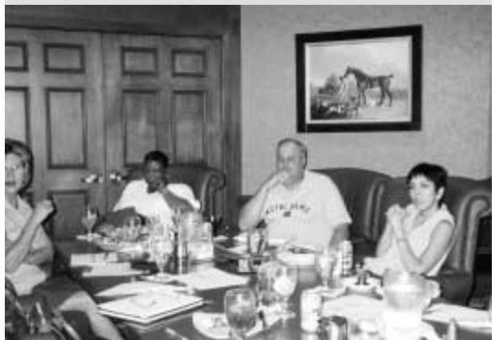
OHPELRA Board of Directors meets at Cherry Valley to plan 2003 Annual Conference